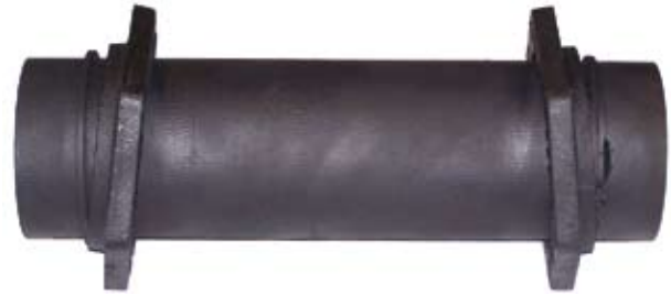
Swivel x Swivel DI Anchor Coupling

* Hydrant Tees may be ordered from page B-4.