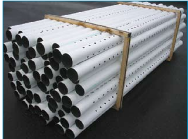
Available in solid and perforated

Sewer and Drain pipe is available for domestic sewer and drain, septic systems, foundation underdrains and other non-pressure drainage applications. It is not damaged by soil shifting, frost, freezing and thawing conditions when proper bedding and backfilling are used. Its construction provides a rust, corrosion, moisture and root proof installation with high flow capacity. S&D pipe is lightweight, easy to handle and install. This pipe is available in 4" and 6" sizes, both solid and perforated, with standard bell and spigot laying lengths of 10'. No gaskets or cement are required to complete the joint assembly.